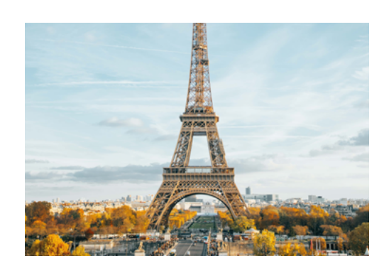
PARIS Economic centre of the EU