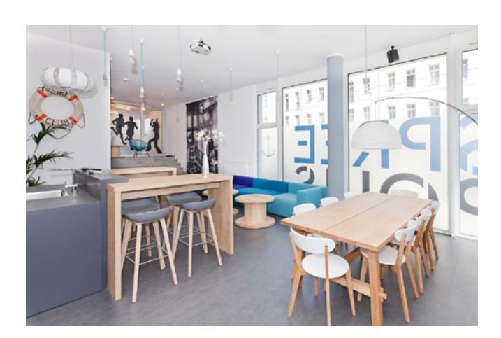
9. Berlin Student Residence at Spreepolis