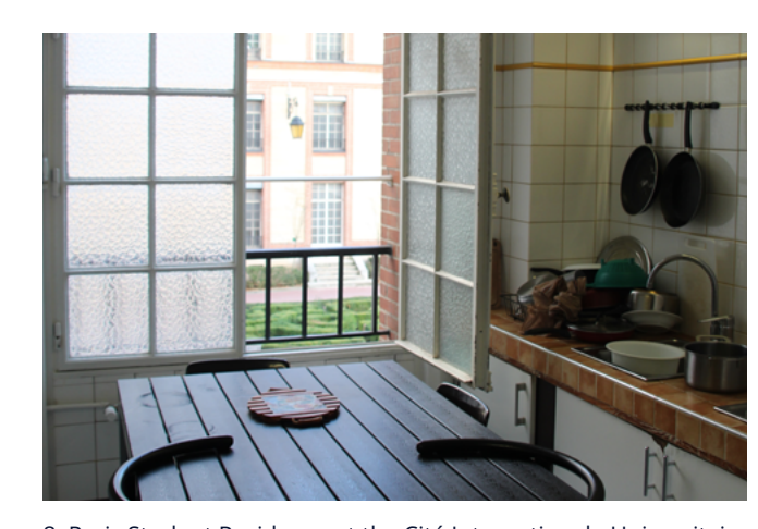
8. Paris Student Residence at the Cité Internationale Universitaire