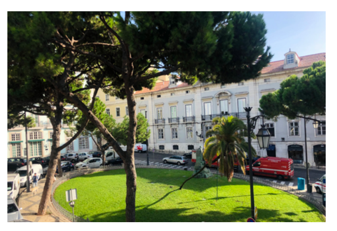
1. Lisbon - View from the Learning Centre