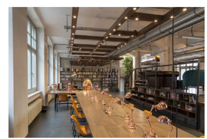
6. The Factory – Library