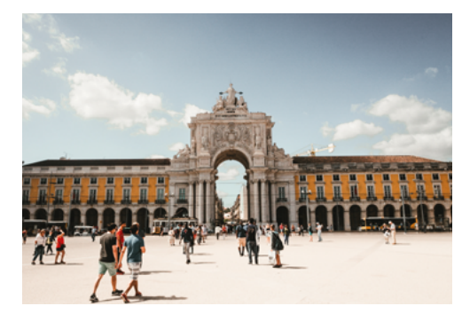
LISBON New capital of well-being and start-ups

Our students spend their third and final year in Berlin. Our Learning Centre is located in the popular district of Kreuzberg, at The Factory Görlitzer Park. Students will have access to a library, a restaurant, study rooms, and a community of startups, corporations and other university students. Forward Students live in Spreepolis, a residence for international students located in the Schöneweide district, a former important industrial area on the bank of the river Spree. Spreepolis is a 25-minute bike ride from the Factory and 40 minutes by public transport.