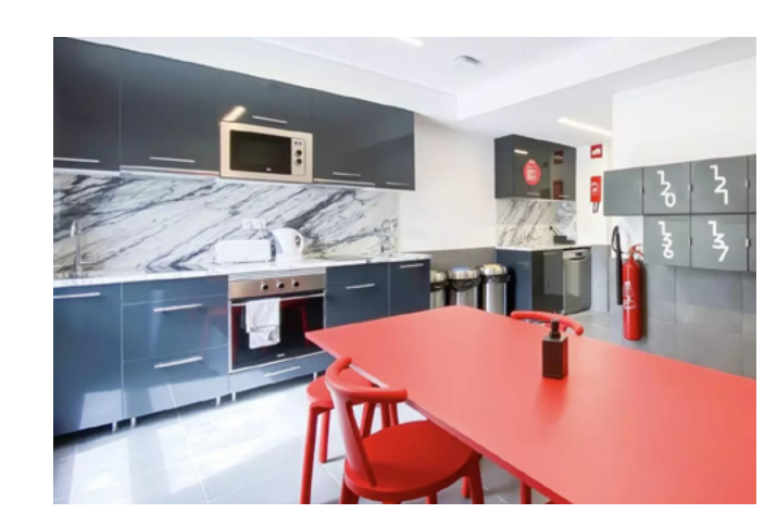
7. Lisbon Student Residence at Xior Benfica