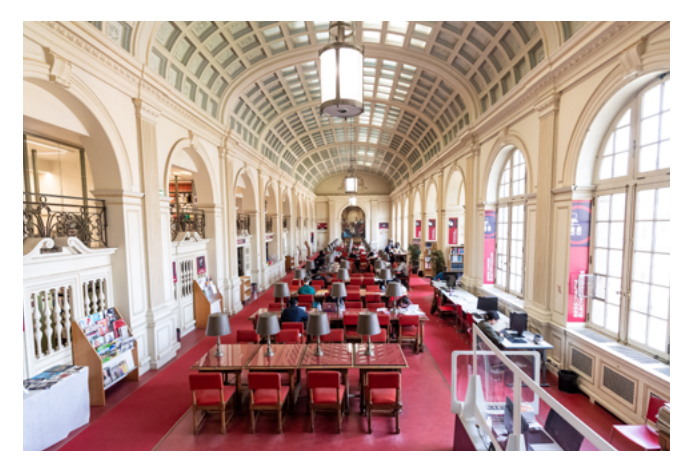
4. Cité Internationale Universitaire - Library