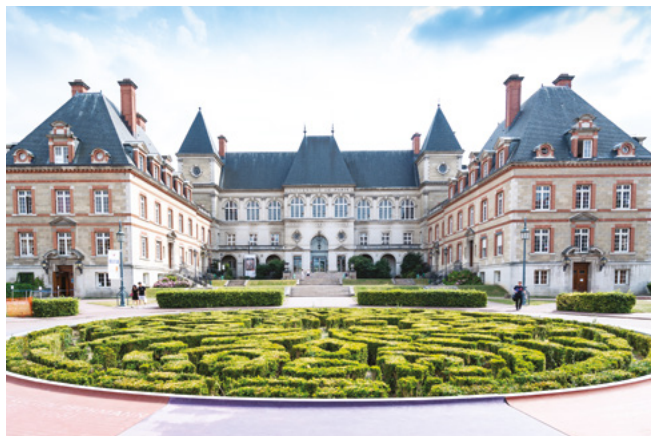
3. Paris Learning Centre at the Cité Internationale Universitaire