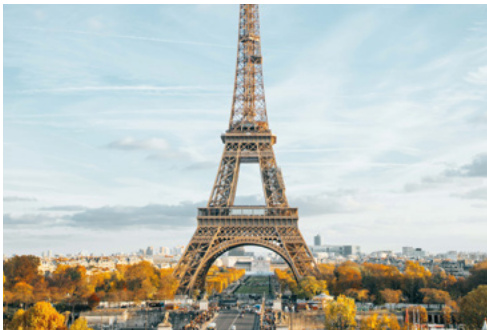
PARIS Economic centre of the EU

Our students spend their second year in Paris, where they both live and study at the Cité Internationale Universitaire located in the 14th Arrondissement in the south of the city. At Cité internationale, the teaching & learning spaces are located in La Maison Internationale. Students have access to study rooms, a library, several restaurants with different specialties at affordable prices and a theater. Students live in Maison du Cambodge and in the Residence Andre Honnorat, which will give them access to individual rooms, shared or private bathrooms, shared kitchen, a media room, a lovely veranda, a foyer (including a bar, foosball, pool table & a piano), and a TV room.