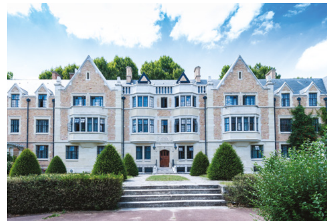
8. Paris Student Residence at the Cité Internationale Universitaire