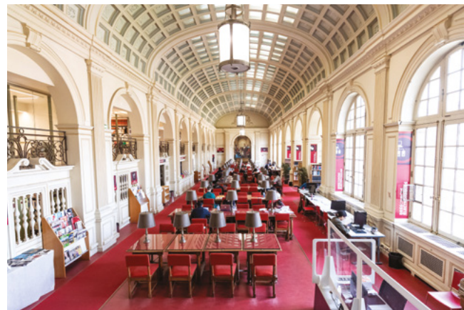
4. Cité Internationale Universitaire - Library