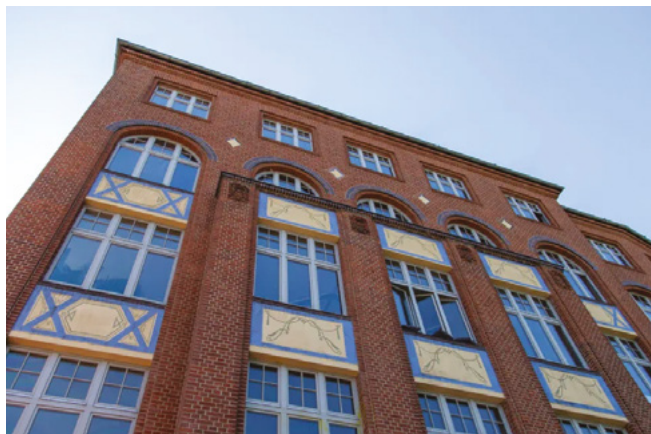
5. Berlin Learning Centre at The Factory