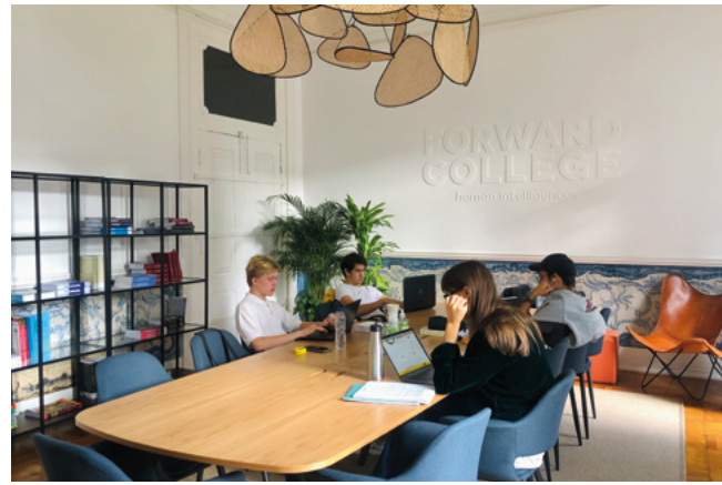
2. Lisbon Learning Centre in the Chiado area