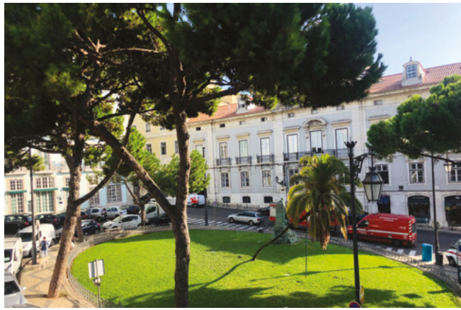
1. Lisbon - View from the Learning Centre