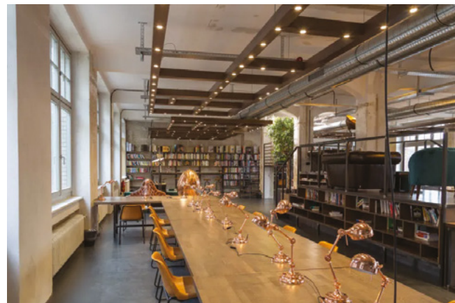
6. The Factory – Library