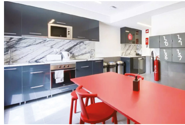
7. Lisbon Student Residence at Xior Benfica