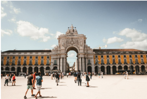
LISBON New capital of well-being and start-ups

Our students spend their first year in Lisbon and the campus is divided across two spaces: the Lisbon Learning Centre, and the student residence. The Lisbon Learning Centre is situated in central Lisbon, close to Chiado metro station, and has several classrooms, a library which also doubles as a space for talks and presentations, study rooms, a meditation room, and an outdoor terrace for students to meet and socialise. Forward's Student Residence is in the Benfica area of the city, a 20min metro ride away from the Learning Centre. They have private rooms and bathrooms as well as access to communal kitchens, a shared lounge, library, media room, gym, and a private garden.