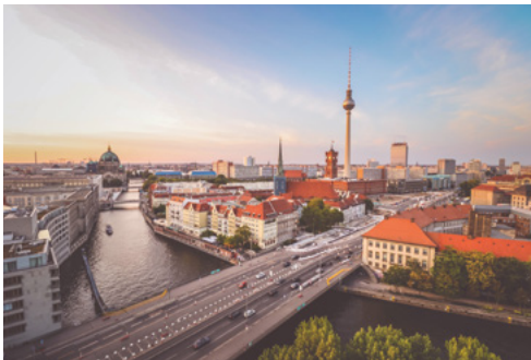
BERLIN EU's most-populous city

Our students spend their third and final year in Berlin. Our Learning Centre is located in the popular district of Kreuzberg, at The Factory Görlitzer Park. Students will have access to a library, a restaurant, study rooms, and a community of startups, corporations and other university students. Forward Students live in Spreepolis, a residence for international students located in the Schöneeweide district, a former important industrial area on the bank of the river Spree. Spreepolis is a 25-minute bike ride from the Factory and 40 minutes by public transport.